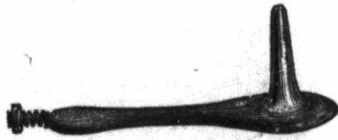
No. 11.—Rectal Electrode.