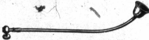
No. 13.—Bell-shaped Uterine Electrode.