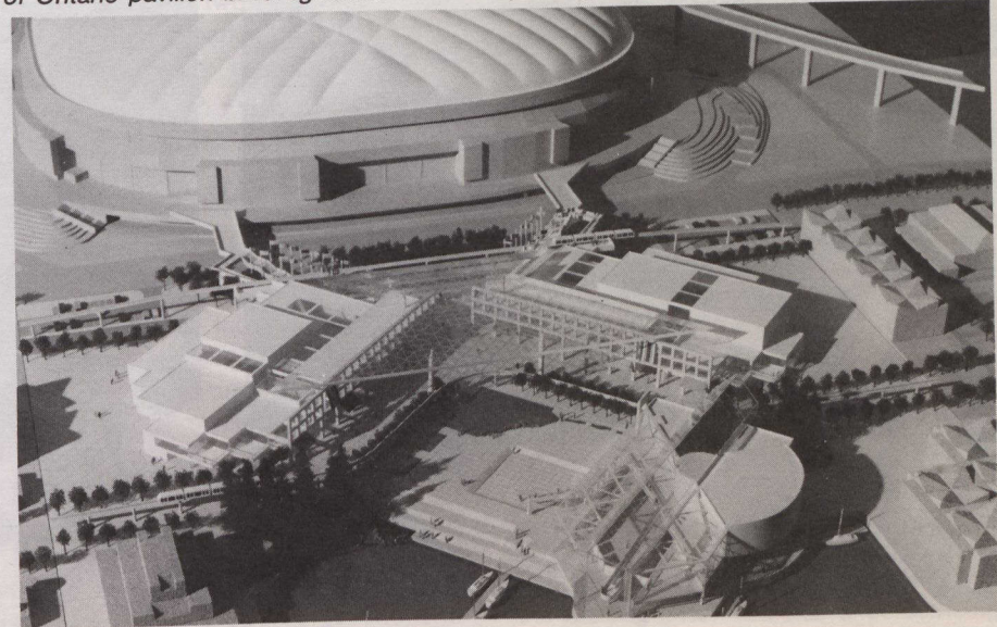
The British Columbia pavilion with the stadium in the background. A Plaza of Nations at the centre of the complex leads to a man-made forest and coastal rockery at the water's edge.