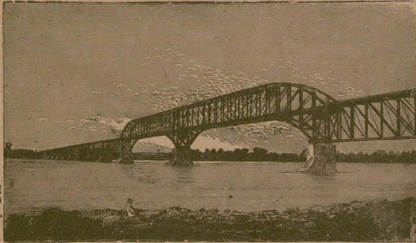
ST. LAWRENCE RIVER BRIDGE, CANADIAN PACIFIC RAILWAY, LACHINE, P. Q.

Railways and Highways Iron Bridges, Turntables Iron Piers and Trestles Bridge Rods Right and Left Hand Sleeve Nuts and all kinds of Structural Iron Work.