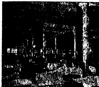
After Luxfer Prisms Installed