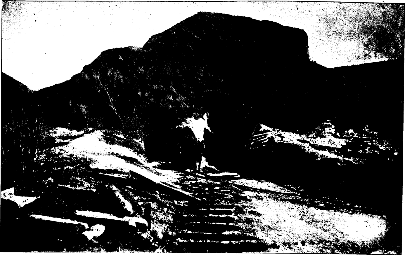
GENERAL VIEW OF THE LETHBRIDGE COLLIERY.