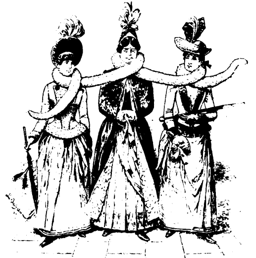
How to utilise those long boas.—A suggestion to economical Mammias.