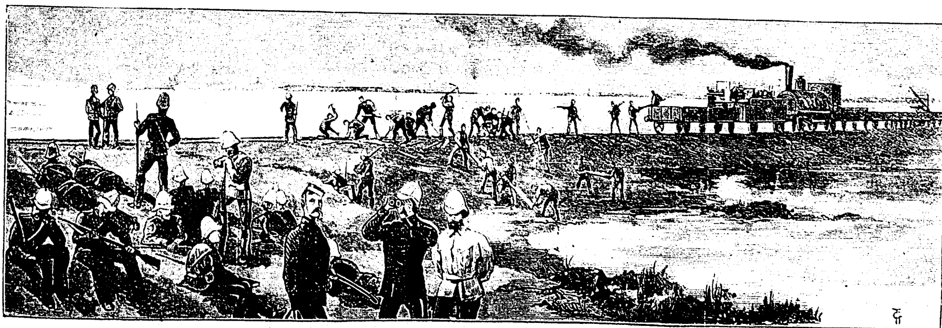
A WORKING PARTY REPAIRING THE CAIRO RAILWAY DESTROYED BY ARABI THE WAR IN EGYPT.—SKETCHES BY OFFICERS OF THE NAVY AND MARINES.