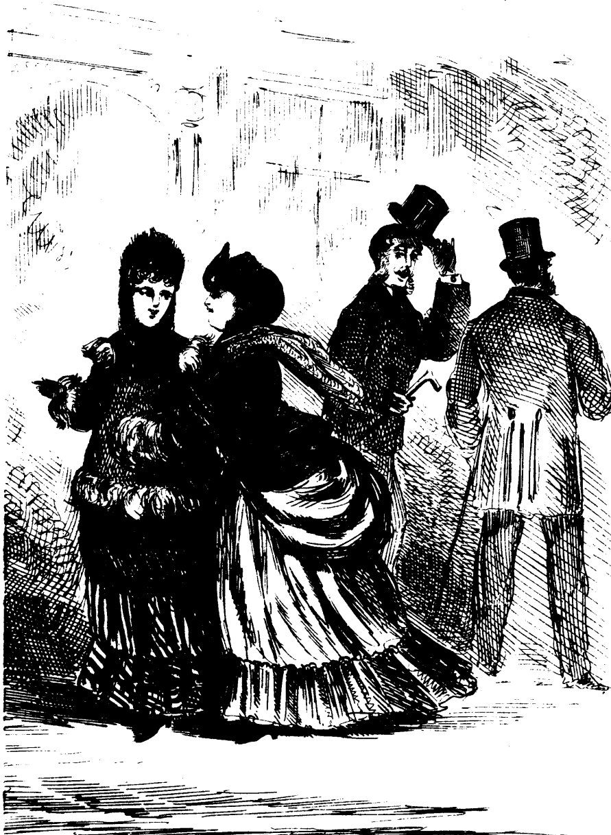
CARRY.—Why, Lizzie, what a very civil bow you gave Mr. Hardware, didn't you cut him last winter? LIZZIE.—So I did; but now that military are so scarce, we mustn't be too particular, you know.