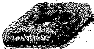
FIG. 4.—THE CHEESE.