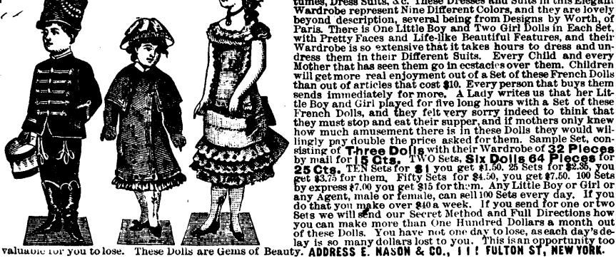
valuable for you to lose. These Dolls are Gems of Beauty. ADDRESS E. NASON & CO., 111 FULTON ST., NEW YORK.