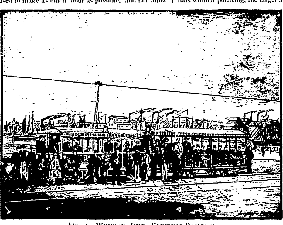
Fig. 4.-Windsor, Ont., Electric Railway.

The superabundance of wheat harvested during the last two or there years reduced the price to a figure that left little or no margin to the producer and exporter. This year, however, crops are short in almost all wheat growing countries, and there would seem to be good ground for the belief that we shall before long see an advance in prices.