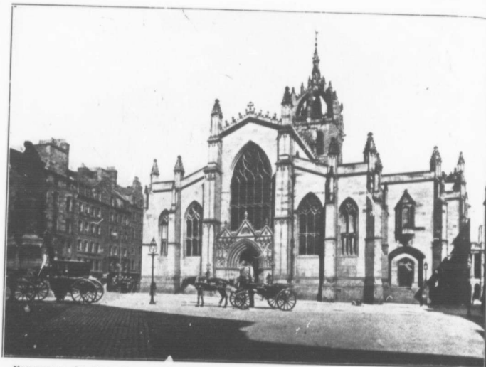
EDINBURGH—ST. GILES CHURCH—The old Parish Church of Edinburgh dating from the 15th Century. It was restored by the late Dr. Chambers, the work being completed in 1883.