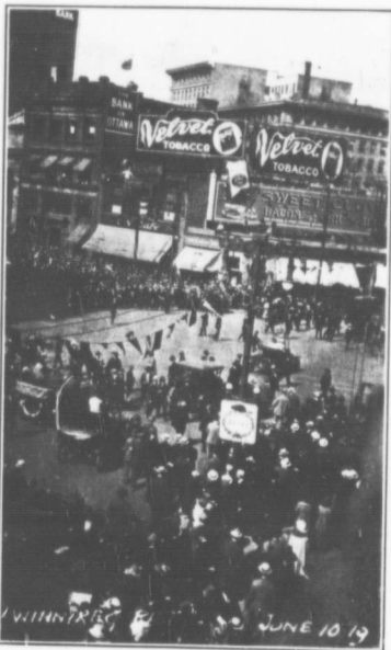
Another scene in Winnipeg during the strike.