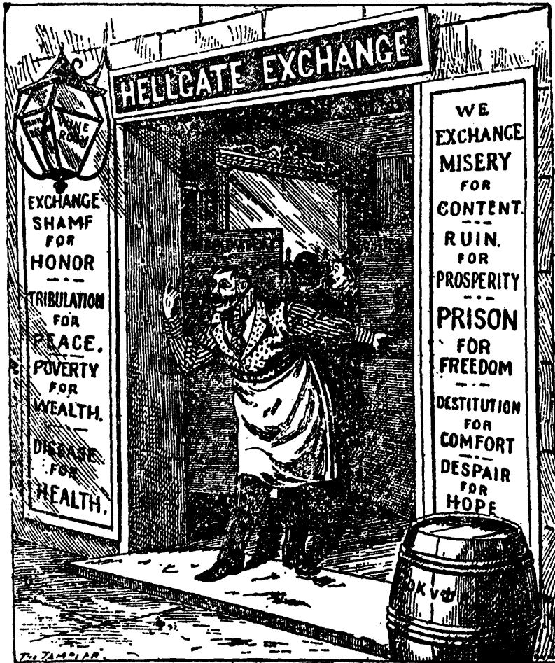
THE OPEN DOOR.

The Toronto 'Globe' says 'Men do not become drunk of set purpose. It is the Open Door that entices them in . . . . Half the battle is won by the removal of the saloon.' But who is that man inviting men and boys in to it ?