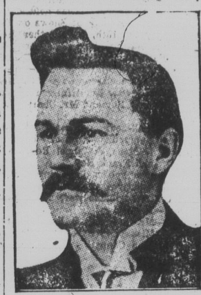
GOES TO THE COUNTRY

Following the adjournment of the sessions in Montreal of the International Joint Waterways Commission on Saturday, Premier Veniot and counsel for the New Brunswick Electric Power Commission went into conferences with representatives of the various interests which will be affected by the Grand Falls development and with whom agreements have been in the course of completion. These conferences continued all Saturday afternoon. All agreements for settlement of the various claims which have been under consideration it is believed will be completed within a short time.