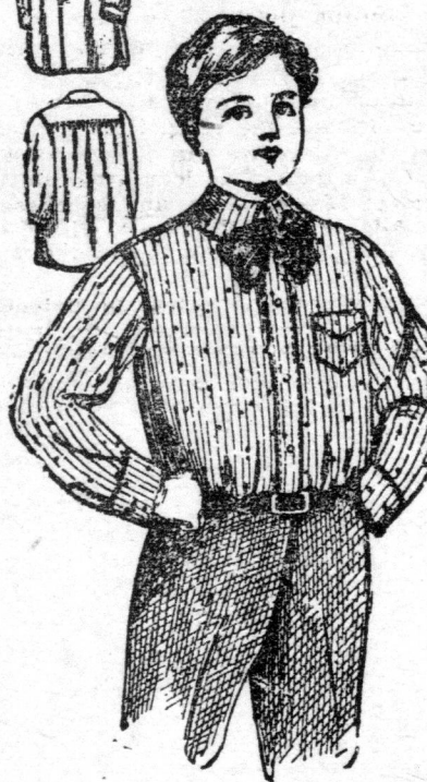
4304—A NEGLIGEE SHIRT FOR THE BOY.

A well-fitting shirt, which does not "ride up" in the back nor constrict the arms or neck is a real comfort to the wearer, whether boy or man. This rare combination of virtues, however, is not often encountered in the shop-made shirt, and for this reason, if for no other, most housemothers prefer to make such garments with their own hands. An excellent model for a boy's negligee shirt is here shown, and will be appreciated by the home-sewer, who recognizes the value of a reliable pattern. It provides for either box pleats, or lap closing, in regulation coat style, and may be made with or without the turndown collar and permanent or detachable cuff. The style is suitable for development in fine flannel, cotton, cheviot, madras, percale or any shirt material. 2% yards 27 inches wide, being needed for the 10-year size.