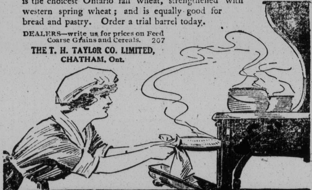
"Canada Food Board Flour Mill License No. 10"

MILLED OF BLENDED WHEAT is the choicest Ontario fall wheat, strengthened with