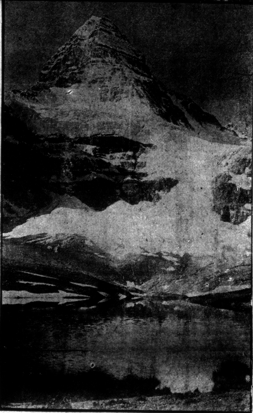
Mount Assiniboine, Canadian Pacific Rockies.

After some comment on the Banff winter carnival, in which the Alpine club takes an active interest, having been donors of a challenge cup for hockey, the director takes up the matter of the forthcoming "Welcome Home" camp to be held at Mt. Assiniboine from July 20th to Sept. 30th. At this camp more than 300 people will be placed under canvas and the special feature will be the fact that all returned members will attend as guests of the club. The camp will be situated three days' journey from the railroad and transportation of baggage will be by a specially organized pack train known as the "Alpine club pack train." Of special interest to the general public is the fact that this pack train will be in operation throughout the summer and anyone wishing to make a really interesting trip into the heart of the mountains can do so at a minimum expense. The camp at Mt. Assiniboine and the "Overnight Camps" on the way thither from Banff will be open to the public from the first of July until the end of September, except during