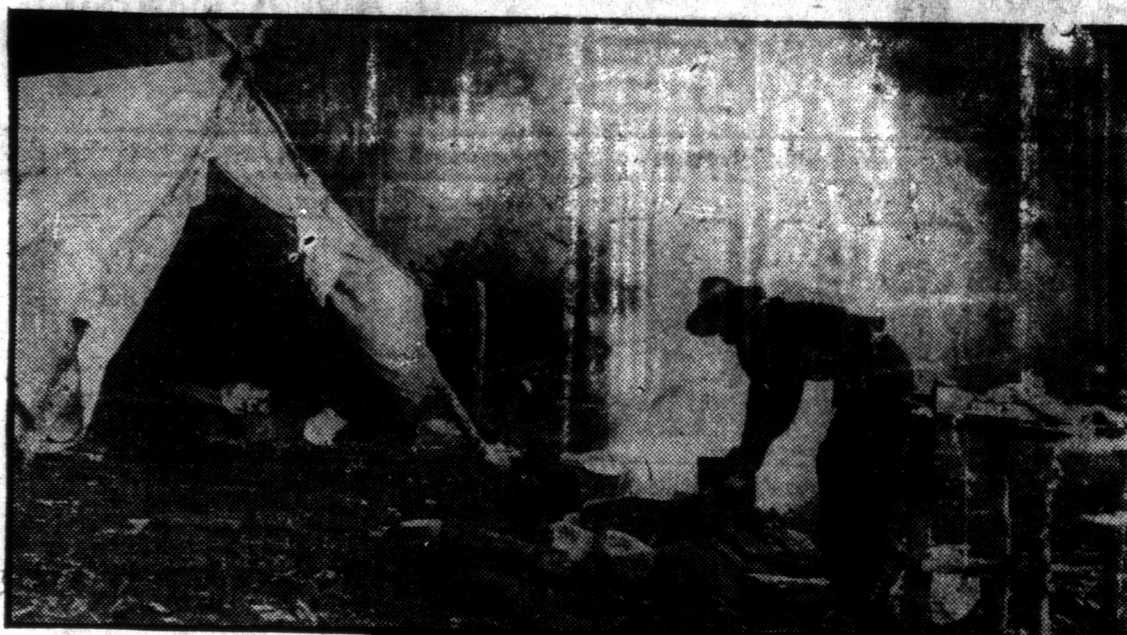
Where the Appetite is Always Keen.