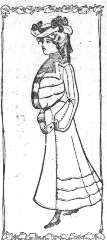
GIRL'S TAILOR MADE DRESS

Three-quarter raincoats made of diagonal are very smart for rainy day and cool weather wear. They are