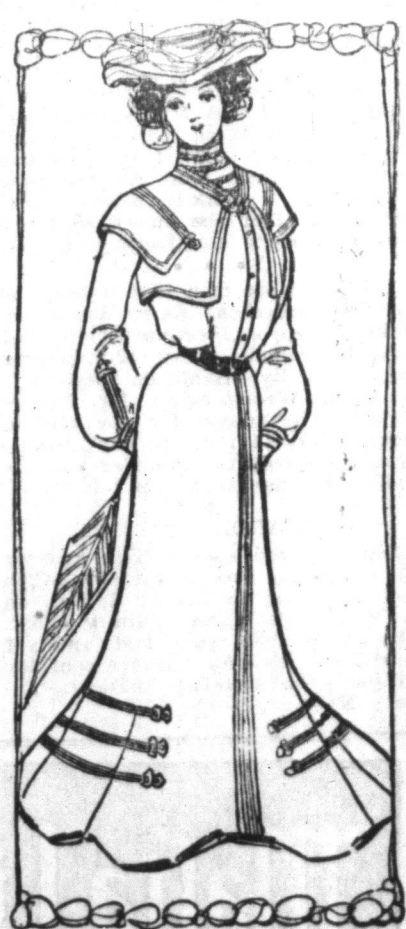
PLAIN STREET DRESS.

Many of these blouses do not meet in front, but fasten over a plastron of cloth more or less decorated or embroidered, or there is a plain plastron of the material over which is arranged