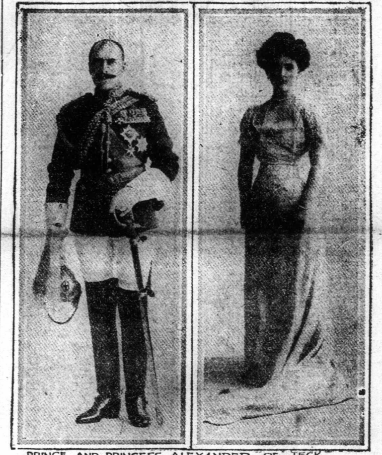
PRINCE AND PRINCESS ALEXANDER OF TECK. Official word comes from London that Prince Alexander of Teck, third son of the late Duke of Teck and brother of Queen Mary, is to succeed the Duke of Connaught as Governor General of Canada.