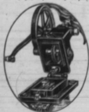
Easy Accessibility to Working Parts. All Gears Run in Oil. No Oiling Necessary.

Repairs.—There are hardly any parts of this Separator that can possibly wear out or give you trouble; but we assure you that we have these repairs stocked on hand at all times to take care of any parts you may require.