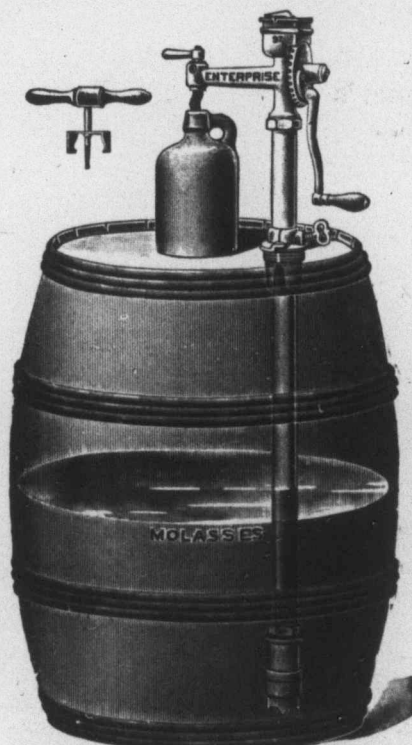
SELF-PRIMING AND MEASURING PUMP