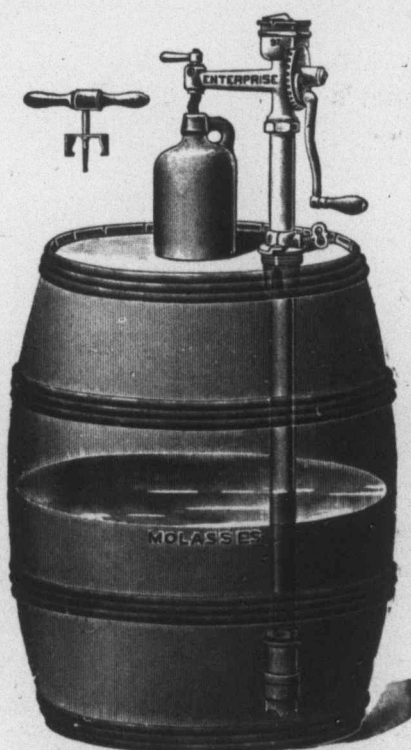
SELF-PRIMING AND MEASURING PUMP