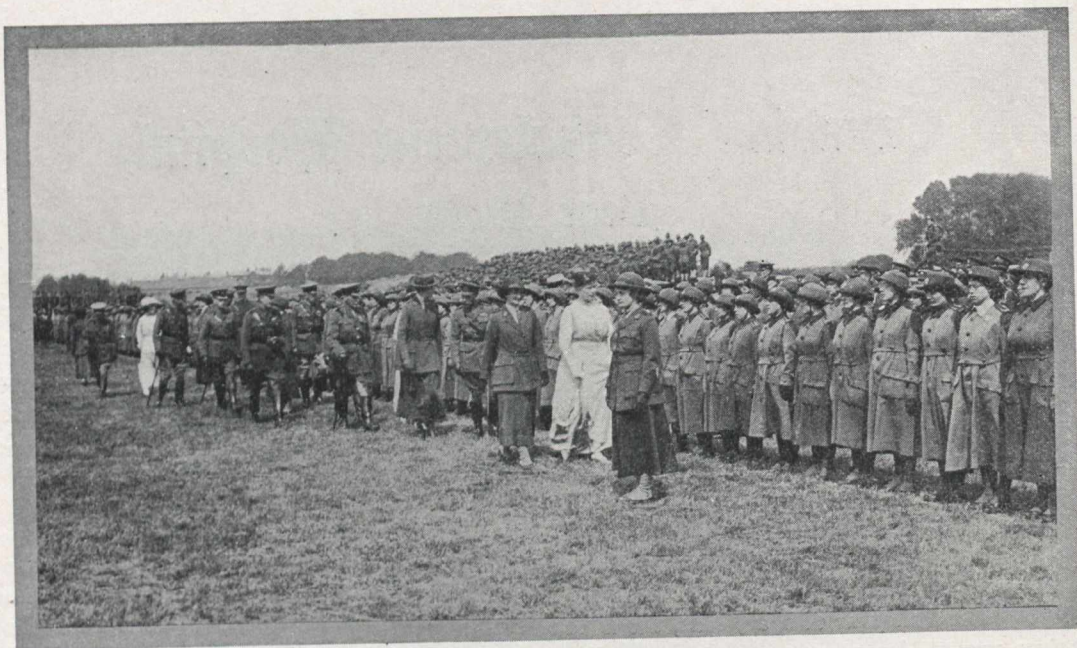
Bear Wood Deputy Controller and Q.M.A.A.C. personnel being inspected by Queen Mary at Aldershot, June, 1918.