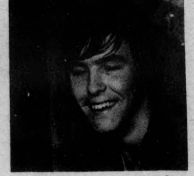
Parker Knox Arts 3 I think it's disgusting and it makes people appear smarter than they really are.