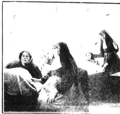
Belgian peasants, mostly women and children, who were injured by German forces