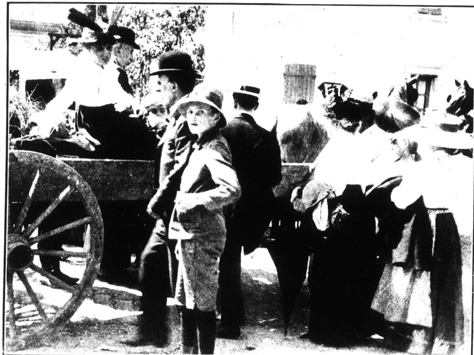
American refugees bargaining for transportation from war zone