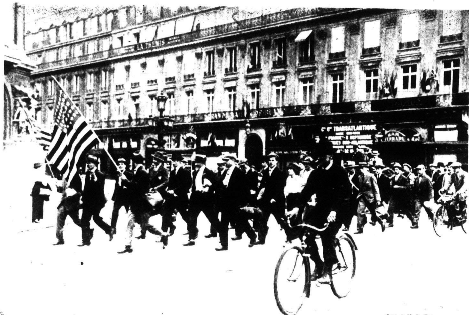
American Volunteers in Paris off to join the French Army