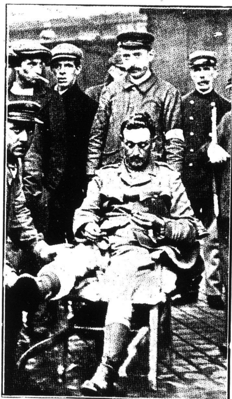
First wounded British Officer to arrive in England