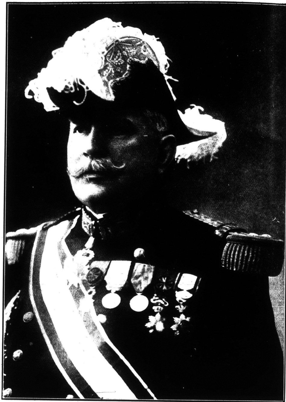
General Joseph Joffre, Commander-in-Chief of the French Army