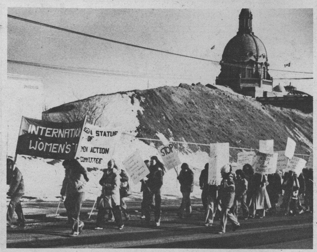
The IWD march up 109 Street to Sir Winston Churchill Square.

existing systemic discrimination under the existing legislation," he concluded.