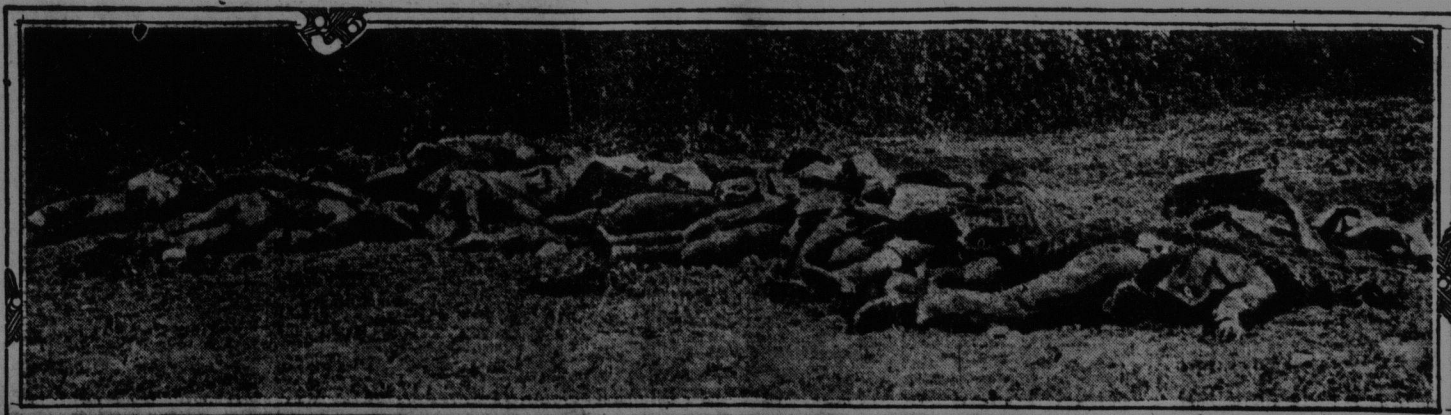
GERMANS KILLED in the BATTLE of SOISSONS, SEPTEMBER SIXTEENTH—

This picture illustrates a view of the battlefield of Soissons, France, immediately after the great battle of September 16, showing some of the dead German soldiers who lay on the battlefield where the Allies engaged them.