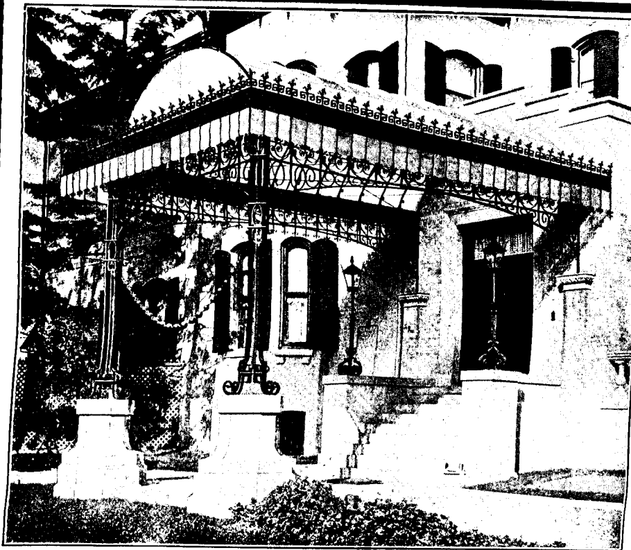
Porte Cocheré, an example of our Ornamental Iron Work.