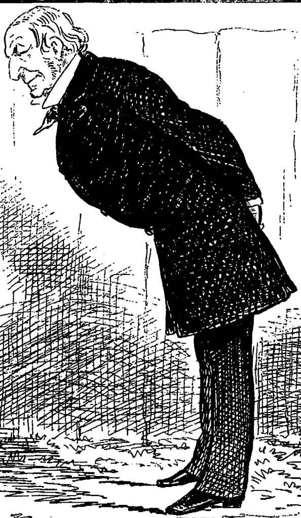
PRINCE LEOPOLD OFFERS TO SERVE HIS CROWN.

THE GRAND OLD MAN.—"WANT TO BE GOVERNOR-GENERAL OF CANADA, HEY? WHY, MY DEAR, THE CANADIAN NATIVES ARE ALMOST BIG ENOUGH TO GOVERN THEMSELVES!"