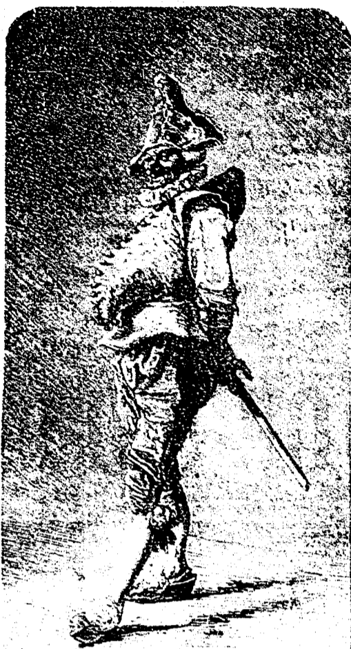
POLICHINELLE (The French 'Punch'). FROM THE PAINTING BY MEISSONIER.

Gray's SYRUP OF RED SPRUCE GUM SOLD BY ALL DRUGGISTS FOR COUGHS & COLDS