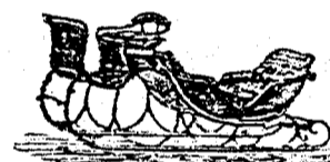
Sleighs, all kind of Sleighs always on hand, cheap. Repairs promptly attended to.

Gray's SYRUP OF RED SPRUCE GUM SOLD BY ALL DRUGGISTS FOR COUGHS & COLDS