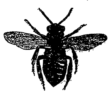
(Fig. 1). Wax Secretions.

As soon as the swarms have issued from the hive, the bee - master should exert himself to induce the bees to 1 to duce the greatest possible quantity of honey, and, to this end, the hives and sections should be fitted with empty combs, or with foundation. Ít is very interesting to see them working at the erection