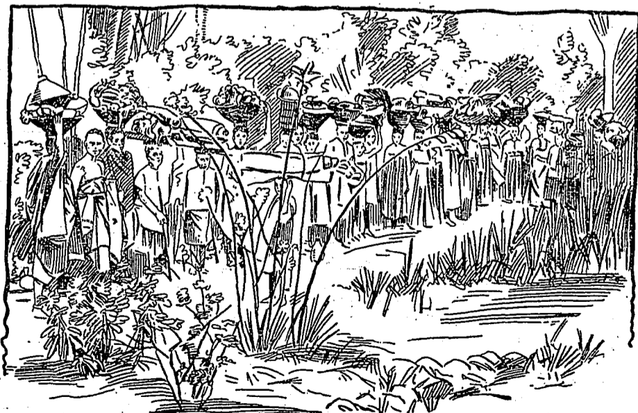
WOMEN FOLK ON THEIR WAY TO THE MEETINGS, SAN SALVADOR

The men in the living-room whose door was opened seem to be rushing in all directions at once, pulling on coat, hat, boots, and yet all soon are jumping one way. They