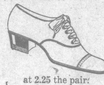
at 2.25 the pair

Lots of other styles to select from up to . . . . .3.50