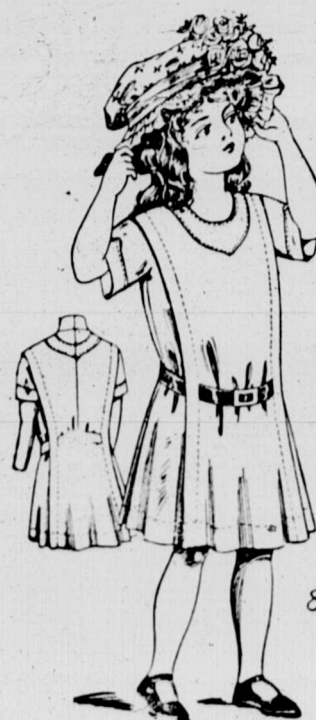
8952. A Comfortable-Frock for the Little Miss.

For all lingerie fabrics, this model will be found most desirable. The fronts of the Cover are crossed in surplice style, and there is no fulness above the bust. The Skirt is cut on fitted lines and is lengthened by a ruffle that may be of lace or embroidery. The Pattern is cut in 3 sizes: Small, Medium and Large. It requires 3 yards of 36 inch material for the Medium size.