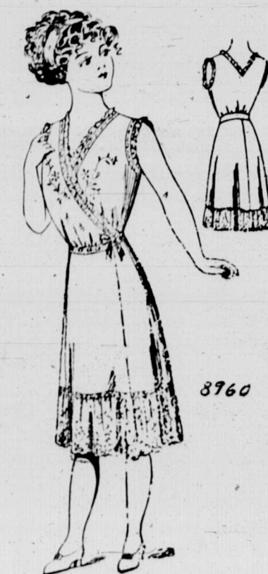
8960. A Splendid-Combination Garment.

Ladies' Surplice Corset Cover with Gore Skirt, with Ruffle.