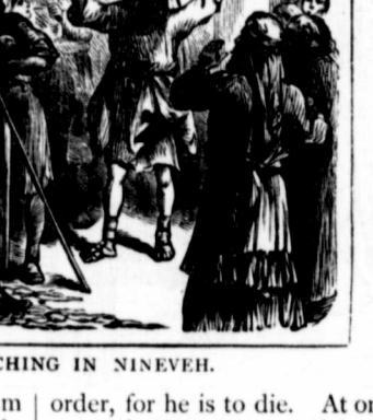
JONAH PREACHING IN NINEVEH.

THE good king is very sick, and the prophet is sent to tell him to put all his business in