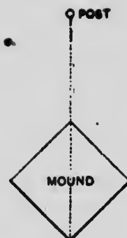
Short Iron Post and Stone Mound