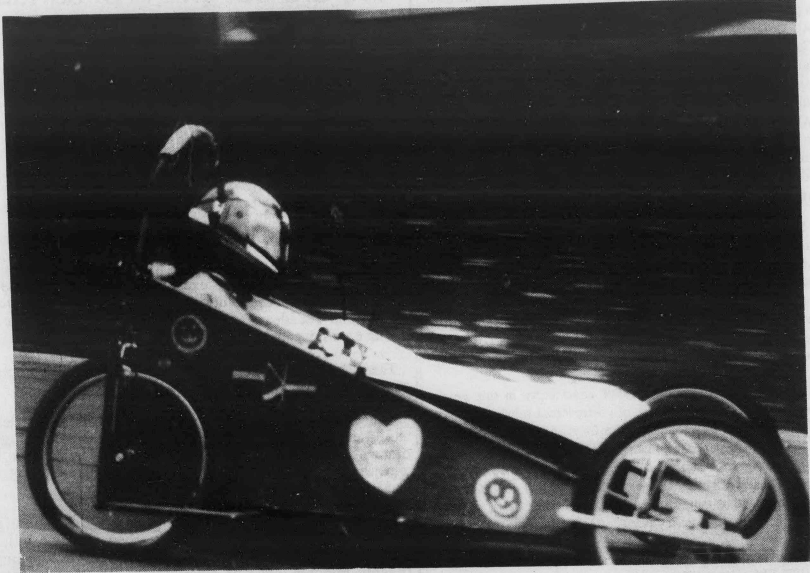
Downhill all the way!