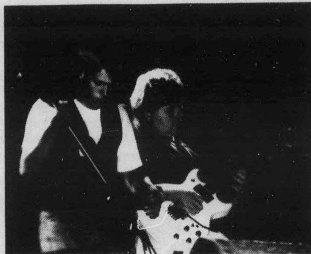
Guitarists from Bedrock, the opening act at the outdoor concert.

Last Thursday night Orientation '90 presented an outdoor concert featuring Canadian recording artists The Box, and a local group called Bedrock. The show attracted a large crowd and the high energy performance left everyone wanting more.