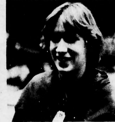
Jean King Nurs. II I'll go skiing and partying.