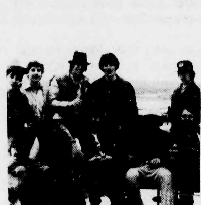
Neill House CE VI Sex, drugs, rock n'roll.