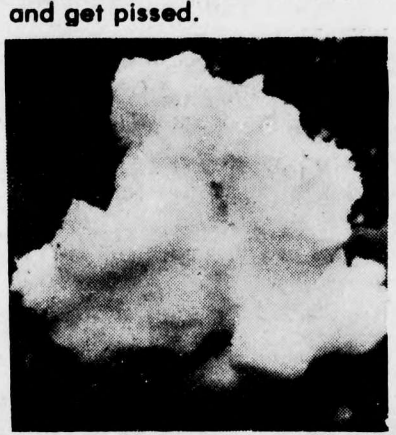
Wed III Snow Get abused and thrown around.