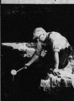
Our own iron-free water

AT THE JACK DANIEL DISTILLERY , we have everything we need to make our whiskey uncommonly smooth.