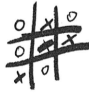
THE SHEAF -

Just because you hear Hoof beats in the fall doesn't mean you should expect a Zebra!