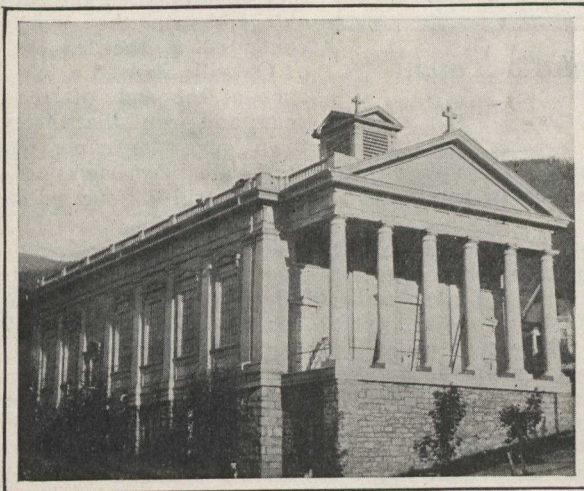
Roman Catholic church with classic architecture and well kept lawn and garcens.