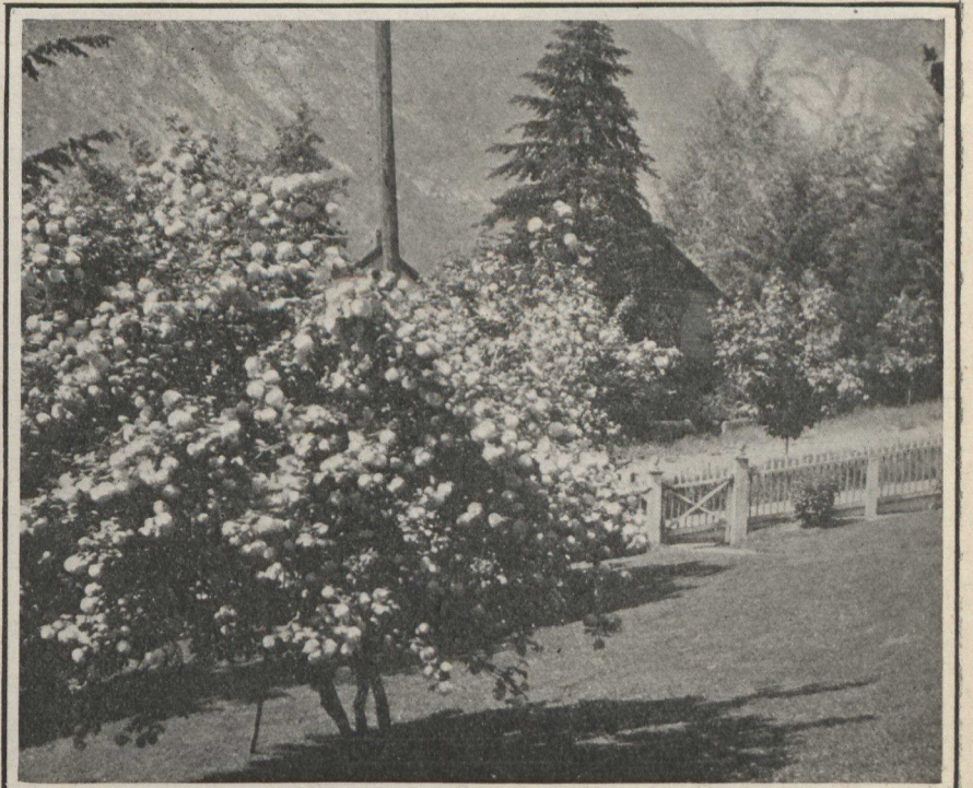
Snow Balls in June This is a sample of one of Nelson's beautiful lawns.