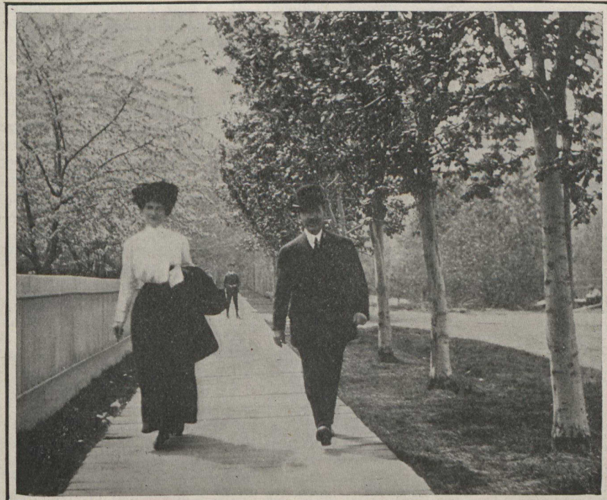
Carbonate Street, Cherry Blossom Time The Nelson City Improvement Society distribute free shade trees every year.

There is such a variety of civic beauty in Canada that comparisons are foolish. Who could compare Quebec with Nelson; Vancouver with Winnipeg; Victoria with Ottawa; Hamilton with Halifax; London with St. John; Edmonton with Calgary; Prince Albert with Brandon; or Toronto with Montreal? Natural setting, much apart from the genius of people has made these places incomparably different. It would be absurd to expect the same sort of beauty from any two of the places mentioned above. One might as well compare Dawson City with Charlottetown. To every town and city as much individuality as may be; the only common feature being a common desire for improvement by making the most and the best of existing conditions, and where nature has been somehow niggardly, supplying the lack with real civic art, suitable to that particular locality.