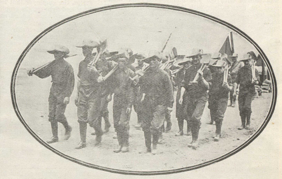
Trench diggers of 60th returning to camp after a day of instruction.

VERY military training ground in Canada is now at its busiest stage. Seventy-five thousand men, fully equipped and fairly well trained, have crossed the ocean and are either fighting in Flanders or finishing their training at Shorn-cliffe, England. Thirty-five thousand more are being equipped and trained and will go forward some time during the autumn. The First Contingent was collected together at Valcartier, and thirty-three thousand men left in October, 1914, on the one flottle for England. Since then Valcartier has been much less important as a raining camp or as a mobilization centre. The Second Contingent was not Canada before it left VERY military train-