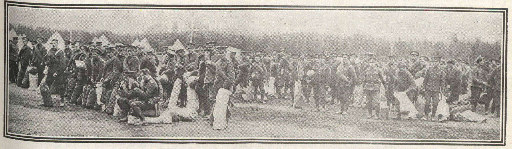
More heroes in training-The 55th Battalion, C. E. F., from Nova Scotia, arriving in camp, July 16th.

Where Some of the Eastern Canada Boys are Getting Their First Hard Training