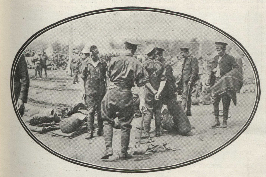
Canadian Mounted Rifles breaking camp before embarking at Quebec.