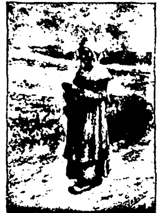
CONCARNEAU PEASANT.—March 1st.