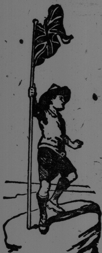
THE BOY SCOUT.

"How to spend Christmas Week" is an interesting article by the Chief in the "Scout." He says: Well, there's only one way that I know of—for real enjoyment—and that is in camp. "Of course it is right and well to be with your family for Christmas Day church and festivities, but for the rest of the week camp is the thing. "Cold? Of course it will be cold in northern countries, but in the 'down under' lands it will be boiling hot. And what of it? Be prepared for it and you will enjoy the outing all the same. I've tried both, so I know. Both in South Africa and on the West Coast of Africa I have sweltered through several blazing Christmas Days, and I've done the same in deep snow and icy blizzards in Afghanistan. And what is more I enjoyed them, but of the two I prefer the cold, for there at least you can make yourself warm. "I'll give you just one little tip that is worth knowing for that purpose. If you