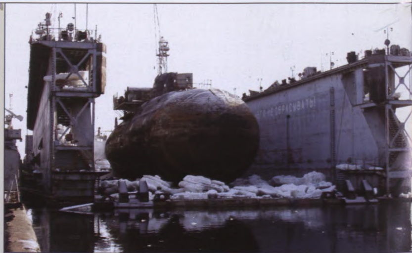
Victor I in floating dry dock just prior to dismantling