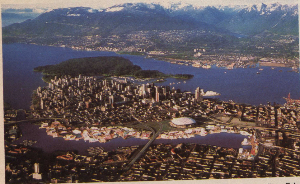
A panoramic view of downtown Vancouver and the main EXPO site (foreground) on False Creek with Canada Place jutting into the harbour in Burrard Inlet.