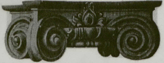
Decorations in Relief for Wall Pannelling, Etc., a Specialty WRITE FOR CATALOGUE